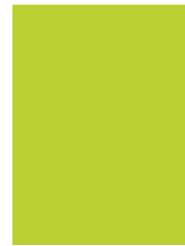
Cost to install solar after incentives